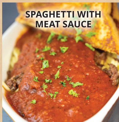
SPAGHETTI WITH MEAT SAUCE

Two grilled boneless chicken breasts topped with bacon, melted Swiss, onions & diced tomatoes $10.75