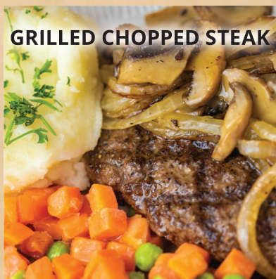
GRILLED CHOPPED STEAK