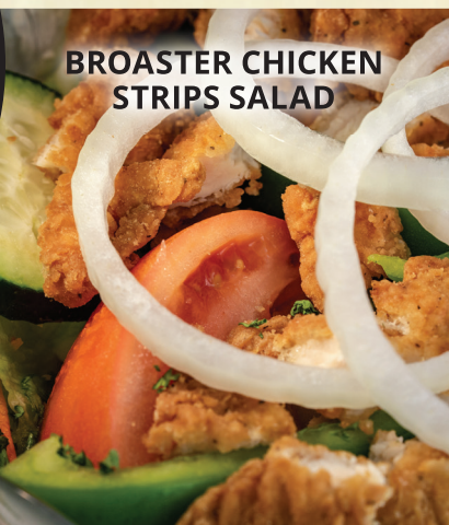
BROASTER CHICKEN STRIPS SALAD