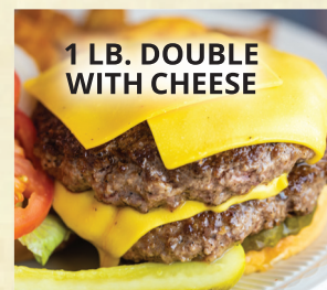
1 LB. DOUBLE WITH CHEESE

DOUBLE DOWN on any burger & make it a FULL POUND for $4