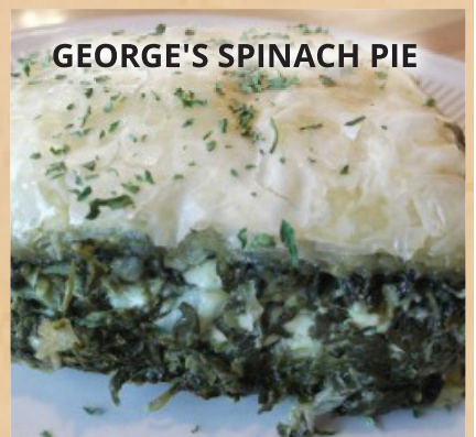
GEORGE'S SPINACH PIE